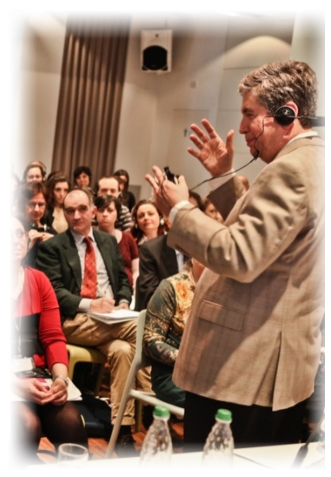
20 seats available only